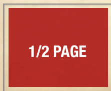
4.5 x 3.625